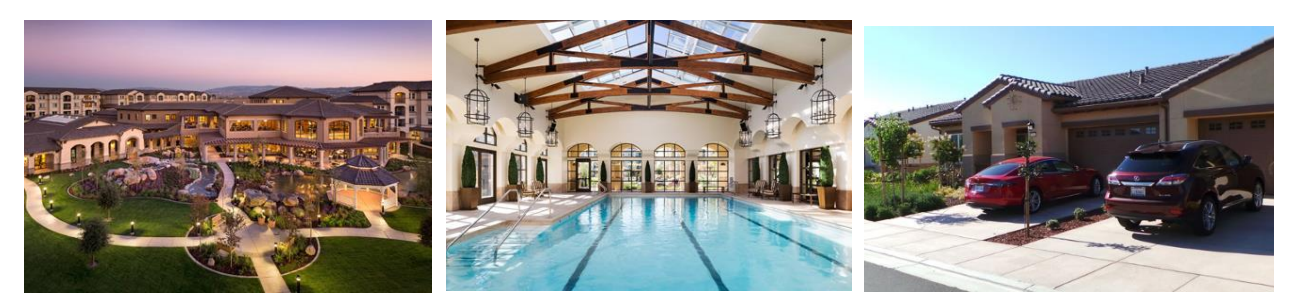
L to R: View of the SRC Clubhouse and the inner courtyard, the indoor swimming pool, and the front view of our new home, showing the typical blue sky and newly planted trees.

A welcoming committee greeted us the following bright, sunny morning and took us to breakfast. We learned that they had lived at SRC for less than a year, and the moving experience was still fresh in their minds. They all wore small nametags, a practice we quickly adopted; they helped memorize names. Susan and I felt accepted and agreed that coming here was the right decision.