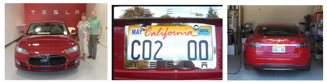
Picking up the car at the factory; Our custom license plate: Zero CO<sub>2</sub>; Charging in our garage.

Driving the Tesla was an absolute joy. The low center of gravity created a safe feeling through cornering. When we released the accelerator pedal, regenerative action slowed the car and simultaneously charged the battery. As we passed other vehicles on the highway, people often turned their heads to stare because, in 2013, Tesla was still a rare specimen. We quickly became the envy of our neighbors as well. Our only mistake was not buying Tesla stock because its price increased 100-fold during the next ten years!