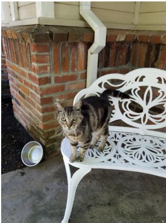
Norman The CAT

We haven't seen him for a few days and I think he just found a place in the bushes somewhere and died of old age. Everyone in the neighborhood will miss him especially me, we kind of bonded that old mangy cat and an old man who shared the same name.