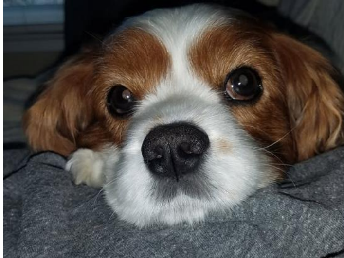
RUSTY BUCKET (9/13/2013 - 1/1/2025)

In memory of our precious “Rusty Bucket” 1/1/2025