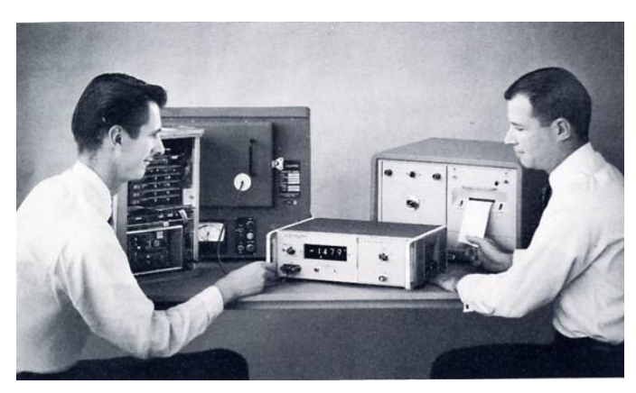
The HP 3440 Series DVM

The introduction of the HP 405 went well, so my engineers immediately began the next follow-on DVM which would become HP's early use of transistor circuitry. This new technology offered increased lifetime reliability, low power and heat, as compared to hot vacuum tubes with fans. The product strategy we developed was to use a plug-in configuration so that customer's applications could be matched at the customer's bench. There were automatic ranging plug-ins and later a truerms detection capabilities. The product photo shows the associated digital printer,