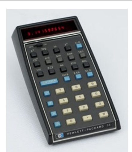
The HP-35 enabled the ordinary engineer at their workbench to eliminate the drudgery of computations. It was a "brain-power multiplier."