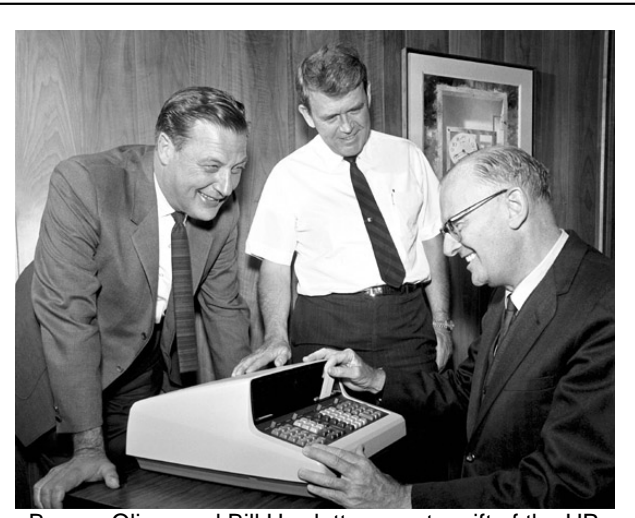
Barney Oliver and Bill Hewlett present a gift of the HP 9100A to Arthur Clarke, science fiction writer and author of the science movie bombshell, <u>2001: A Space Odyssey</u>, The gift offered a media testimonial windfall for our HP desktop mathematical computation.

http://hpmemoryproject.org/timeline/dave_cochran/a_quarte r_century_at_hp_00.htm to read Dave Cochran's HP Memoir on the 9100A