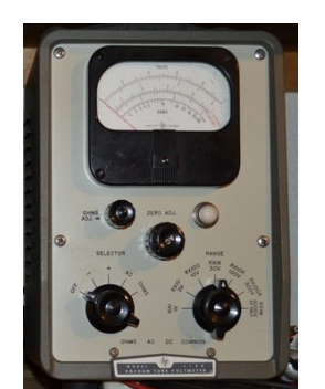
The typical voltmeter used an analog meter movement based on the d'Arsonval principal. Their linearity vs drive current was poor.