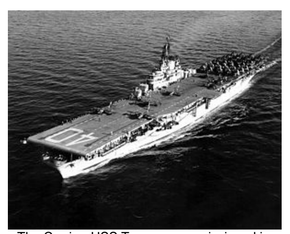
The Carrier, USS Tarawa, commissioned in mid-1945, was my first duty assignment.

I spent the usual three months in Navy boot camp, about 50 miles north of Chicago. I took the well-